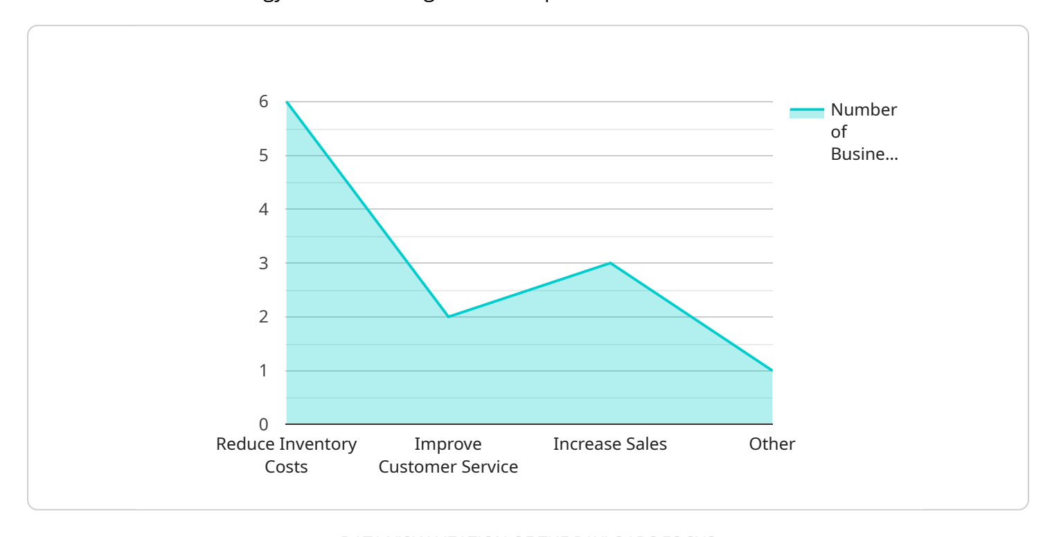
DATA VISUALIZATION OF THE PAYLOADS FOCUS

The provided payload offers a comprehensive overview of Al-driven inventory optimization, a transformative technology revolutionizing business operations.